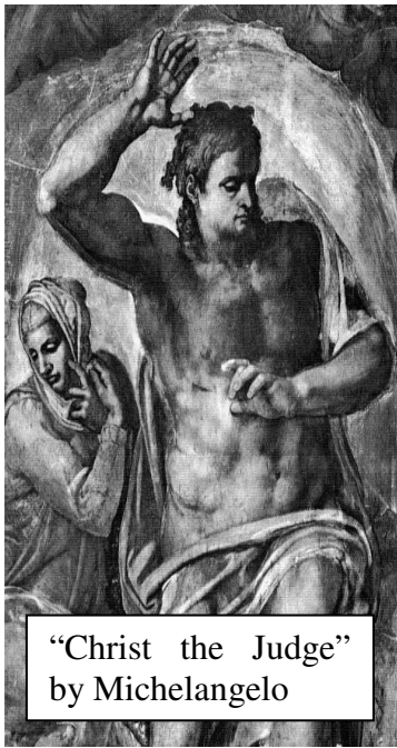
“Christ the Judge” by Michelangelo

The example would be improved if you had hit the judge's car. The judge must uphold the law and is compelled to exact the penalty for violation because if he does not support the legal structures of society, those structures will collapse. However, having fined you, the judge now pays your fine.